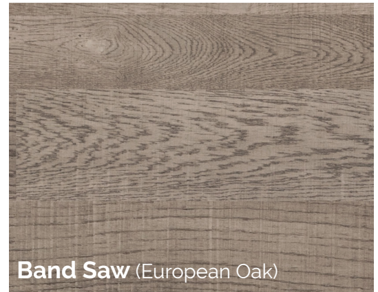
Band Saw (European Oak)