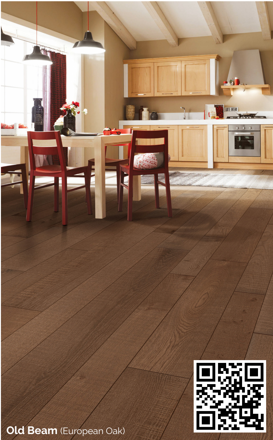
Old Beam (European Oak)