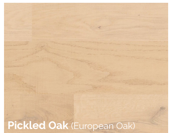
Pickled Oak (European Oak)

From raw materials to finished products, every step is handled with utmost grace to add quality and durability. The range of colours and design in the Miller's Reserve Collection will provide the perfect element to transform your desired space into a rustic and elegant feel.