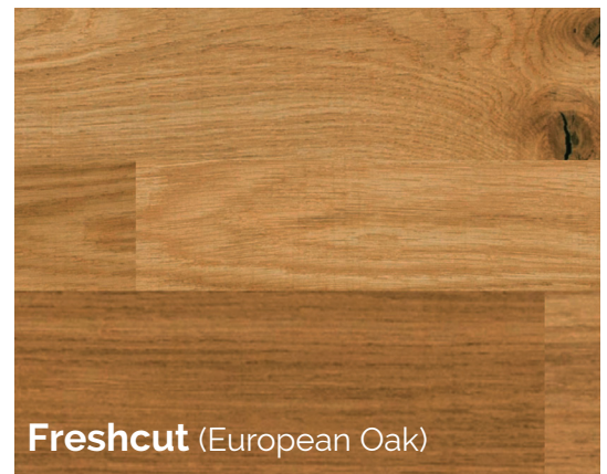
Freshcut (European Oak)