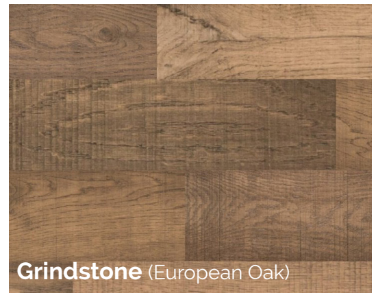
Grindstone (European Oak)