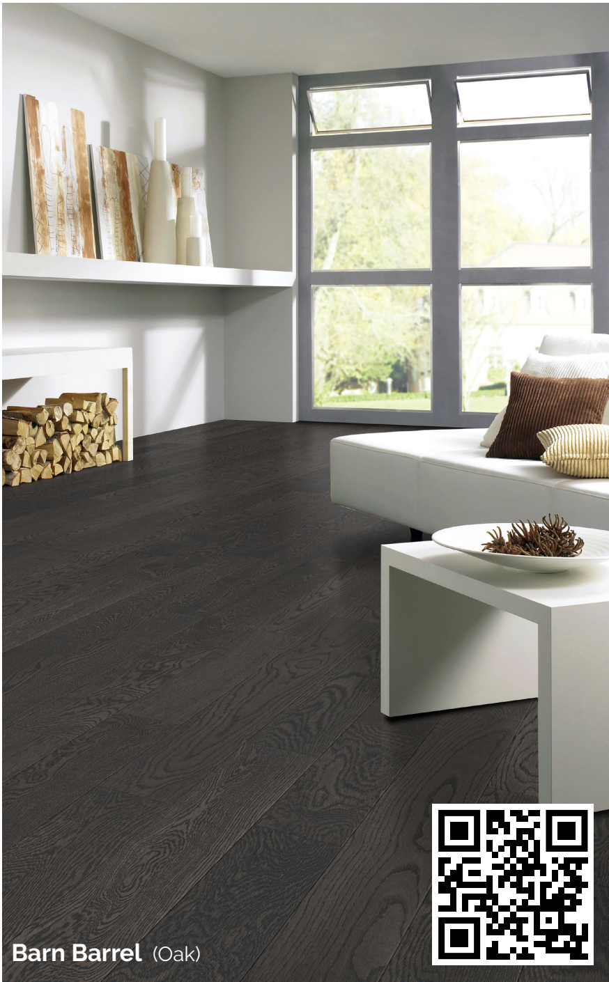
Paddock Fence (Red Oak)