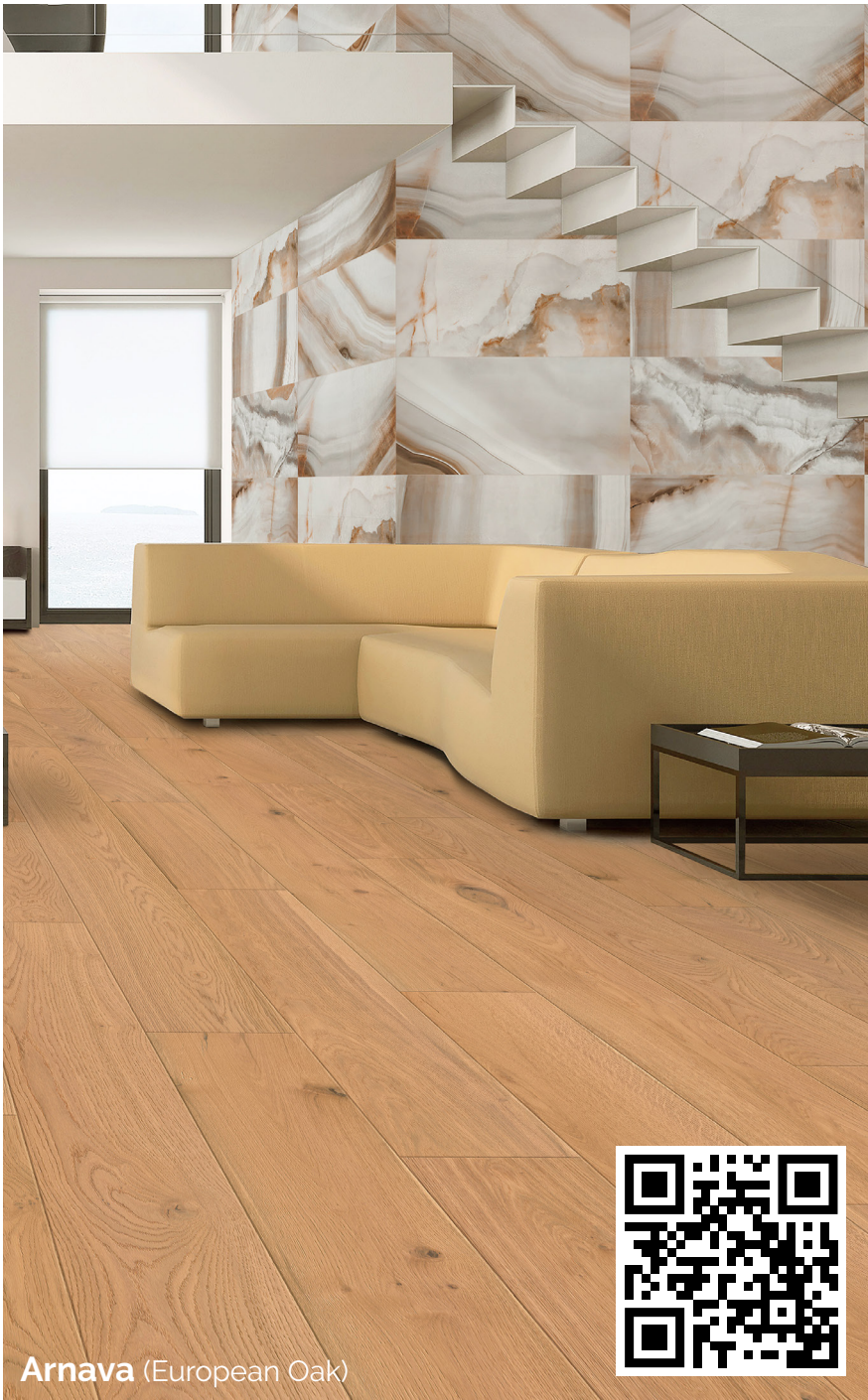
Bonavista (European Oak)