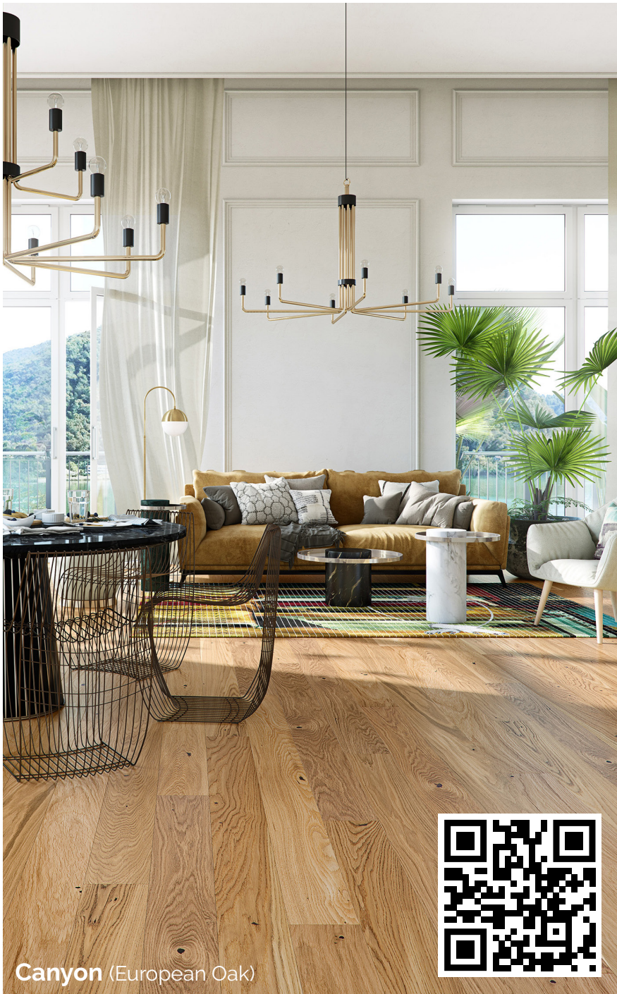
Caravan (European Oak)