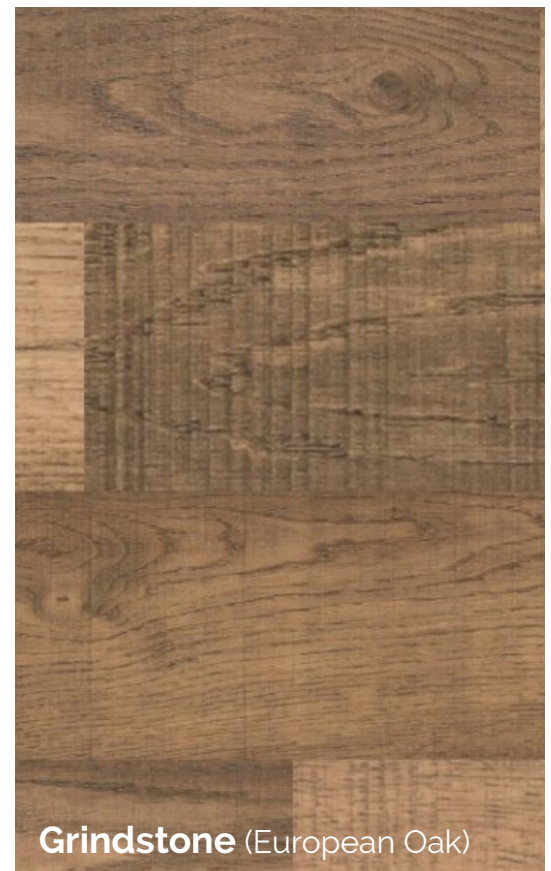
Grindstone (European Oak)

From raw materials to finished products, every step is handled with utmost grace to add quality and durability. The range of colours and design in the Miller's Reserve Collection will provide the perfect element to transform your desired space into a rustic and elegant feel.