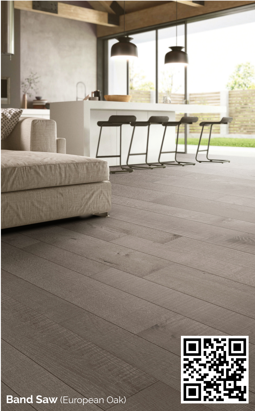
Band Saw (European Oak)