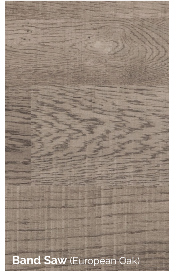
Band Saw (European Oak)